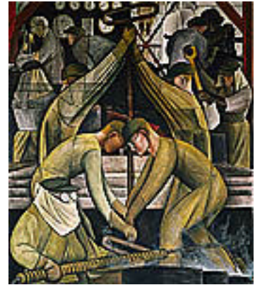
Detail of Rivera’s Detroit Industry.