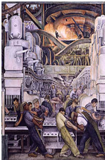
The Diego Rivera mural, Detroit Industry, a highlight of the Detroit Institute of Arts, serves as a visual reminder of the dignity and solidarity of labor as a defining characteristic of Detroit's past and present