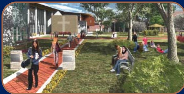
Artist's rendering of the Cardinals Square

Friends of Madonna University may also wish to memorialize a loved one or honor a special person, group or family by Name Recognition in the Cardinals Square with a gift of $5,000 or more.